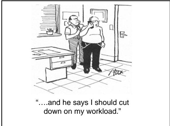
"...and he says I should cut down on my workload."